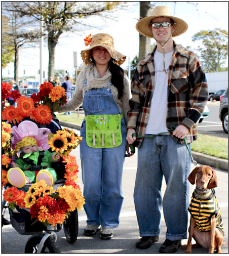
Gather the family for Rockville Centre's 17th Annual Ragamuffin Parade and Party that will be held on Sunday, October 25th.