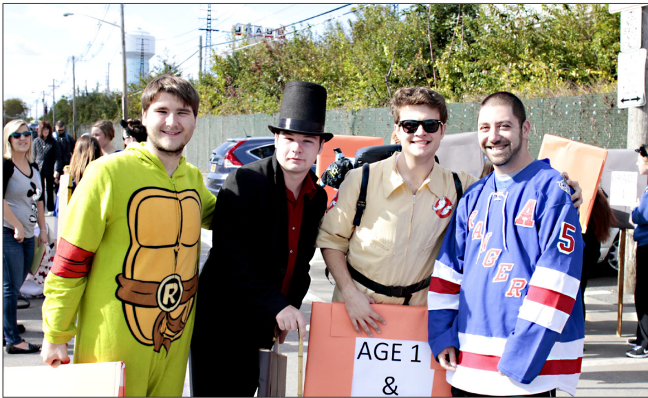
Gather the family for Rockville Centre's 17th Annual Ragamuffin Parade and Party that will be held on Sunday, October 25th.

Children of all ages and their families are invited to take part in our Annual Ragamuffin Parade on Sunday, October 25th beginning at 2:00 p.m. The parade