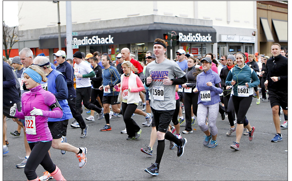
Lace up your shoes for the Village's annual 10K, 5K, and one-mile family fun run on Saturday, November 7th.

is scheduled to begin at 9 a.m. and both the 5K (3.1 miles) and 10K (6.2 miles) races will begin at 10 a.m.