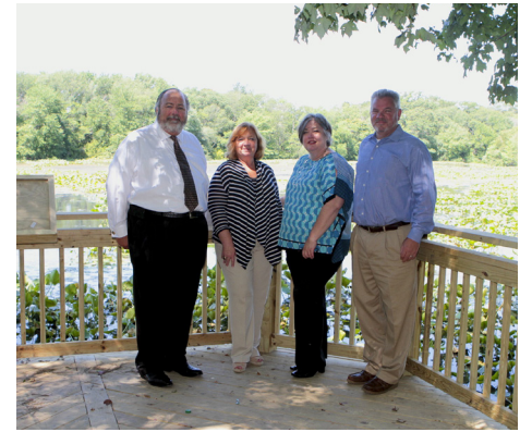
the New York State Office of Parks, Recreation and Historic Preservation.